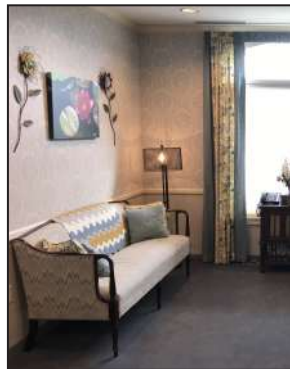
The Evenglow Inn reception area received a refresh, too, making it feel even more like home.