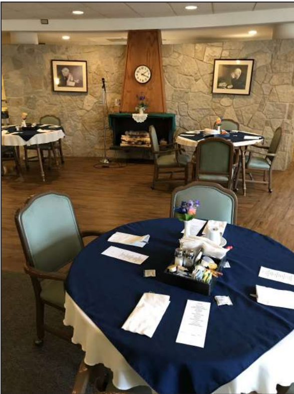
Left and right: Not only the look of the Lodge dining room changed. Menu options also changed, to add some new healthy choices to the many traditional favorites.

“Wow! This looks like a high-end restaurant in Chicago!” says a new volunteer, referring to the Lodge dining room. She loves the beautiful new carpeting, window treatments, and wood-look flooring. And she does not even know what the “before” looked like!